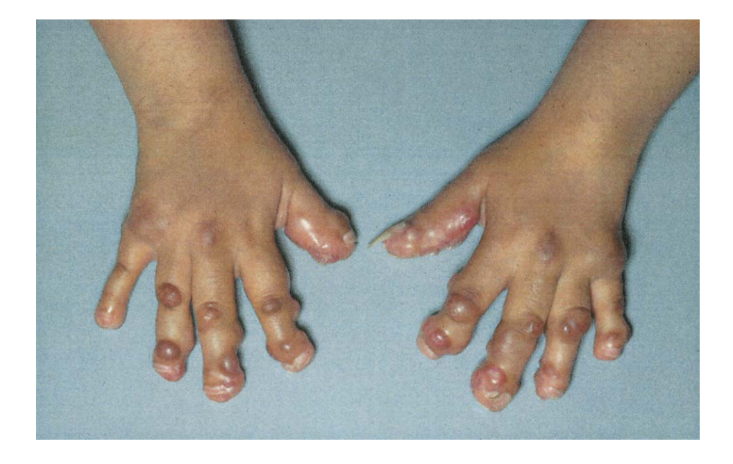
Figure 2 Hands of ID 7, showing nodular lesions and subcutaneous swellings that are typical of JHF

Our data provide strong evidence for the location of a recessive JHF-predisposition gene on chromosome 4q21. The genomic sequence of the critical interval is incomplete, but scrutiny of the Project Ensembl and the University of California, Santa Cruz, Human Genome Project Working Draft databases indicates that the minimal interval is ~6 Mb and contains 19 known genes and 47 predicted genes. Several of the known genes are of potential interest as candidates, including bone morphogenetic protein 3 ( BMP3 ), fibroblast growth factor